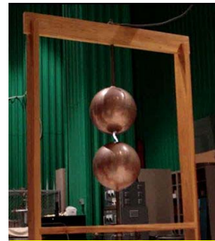
High voltage buses